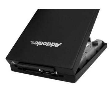
Step 6 Put the top cover on by holding it in near vertical position and sliding the two metal clips inside the two small slots on the rear of the bottom cover.